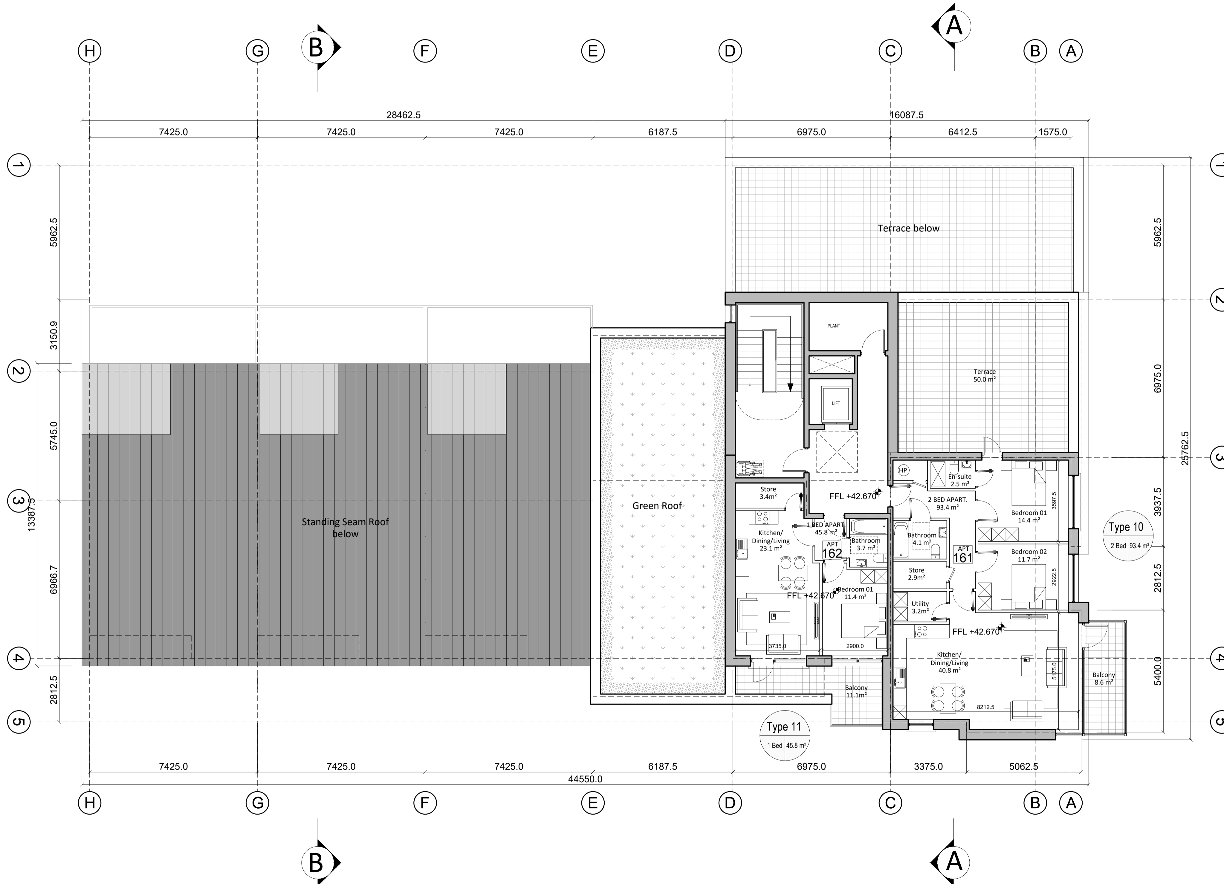
Fifth Floor Plan

NOTE: Do not scale from this drawing, written dimensions only to be used. This drawing is for planning purposes only & not for construction. Levels shown are for information purposes only & may not relate to O.S. Malin Head Datum. For actual O.S. Malin Head Datum always refer to the Site Layout Plan. DDA Architects Ltd. retain copyright and ownership of this design which is not transferable.